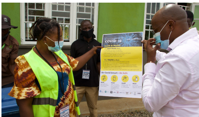
Community leaders being sensitised on Covid-19 prevention