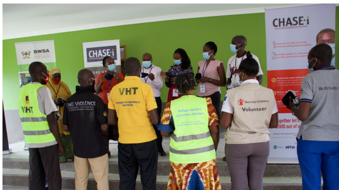
Activating Uganda's Community Engagement Strategy / CES (2020) with community leaders in Kyaka II Refugee Settlement, Kyegegwa District

Considering declining compliance levels, increasing community transmission and a constrained health system, a top-down approach to implementation and enforcement of COVID-19 measures is no longer the most feasible or effective. However, there is room for a more community-driven approach and individual responsibility.